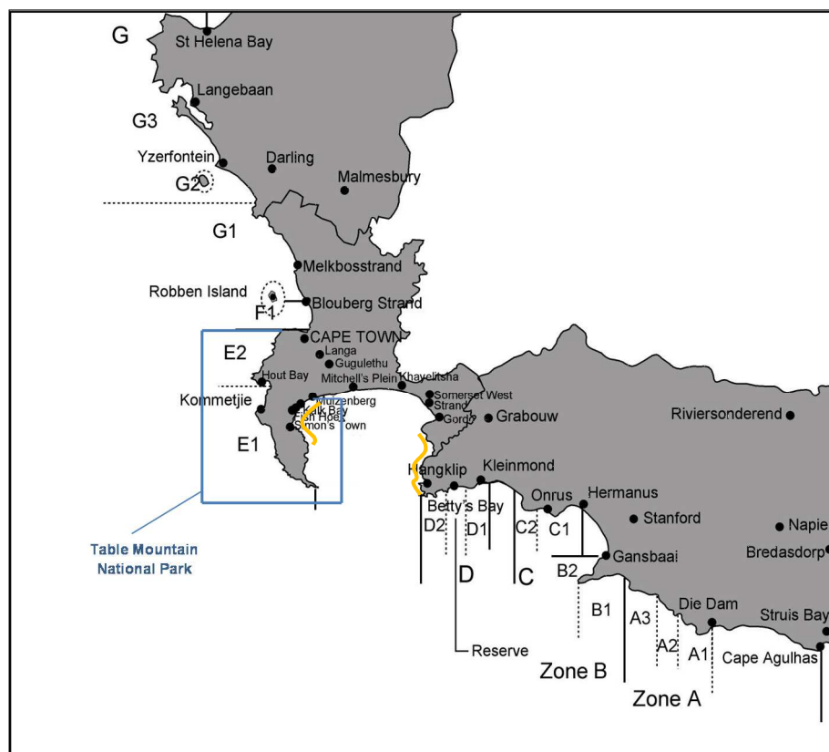
Figure 3. Map of abalone fishing Zones A-D, with sub-zones / TURFS indicated. The relevant Marine Protected Areas are also shown, as well as the experimental area extension of Zone E along the western side of False Bay and the experimental area along the eastern side of False Bay.

abalone fishery in Hangberg (Hout Bay) suggests that the scale of this activity is large (Raemaekers 2013). The study site is located within abalone fishing Zone E (Figure 3), although interviews revealed that most fishing is targeted around Robben Island (Zone F) (S. Raemaekers, pers. comm., August 2013). Based on a conservative estimate of an average of 60 divers, each diving an average of 5 times a month (from Raemaekers 2013), and assuming that each diver catches 80 kg of abalone (whole mass) per dive, an estimated 24 tons of abalone are dived by this group per month (Abalone SWG TG, 15 August 2013). Overall, the indicators from these studies indicate that poaching has been increasing in all areas along the west coast, and in Zone F in particular, and that there is a high level of illegal take that is estimated to be considerably larger than the legal take.